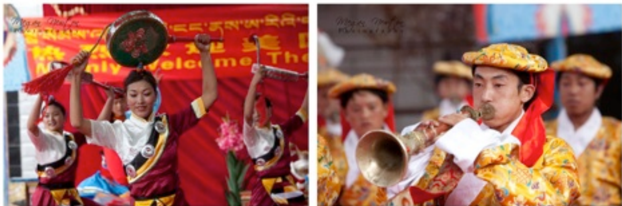
Tibet Chengguan Niang Re Performance Group