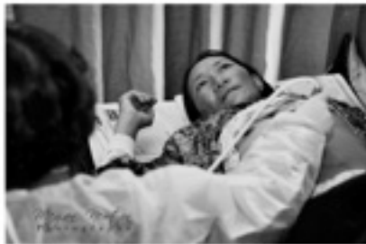
Screening for parasite disease with ultrasound.

Demonstration of screening for echinococcosis using abdominal B-ultrasound was performed in Wumatang village, Damshung County. Originally, 20-30 Tibetans from this village volunteered for the screening. Apparently other villagers learned about the screening after we arrived in the village. We tested a total of 53 adults, including men and women of all ages. The ultrasound detected two cases of CE liver cysts, one inactive and one active. The active cyst was a 4-inch liver lesion in a young woman who was apparently unaware of her infection. Prof. Ito tested her blood sample in a rapid diagnosis kit, which confirmed the infection. The Director-General of the Damshung County Health Bureau and others explained to her how people are infected with CE through accidental ingestion of microscopic parasite eggs. She was then given a regimen of albendazole tablets for treatment of the infection.