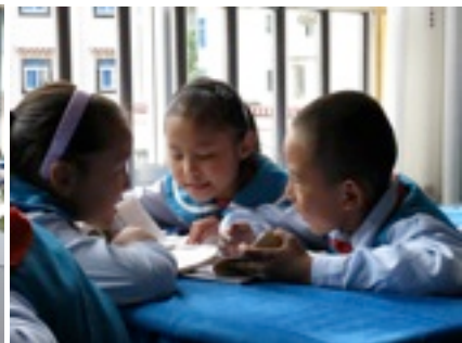
Tibetan Language students working together in a small group.