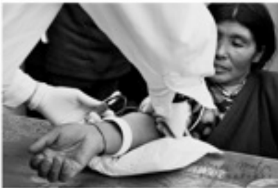
Giving a blood sample for further testing for parasite disease.