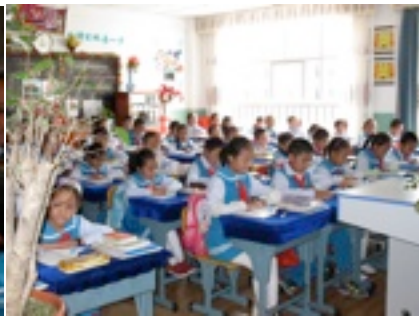
A sixth-grade Tibetan Language class.