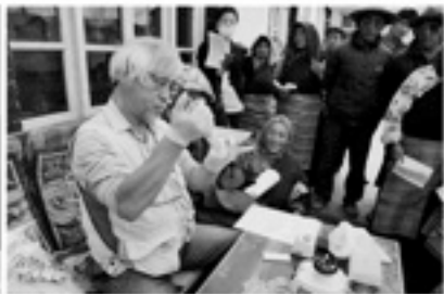
Prof. Ito testing blood sample with rapid diagnosis kit.